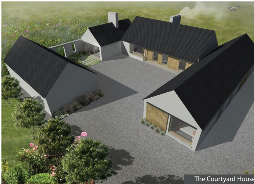
The Courtyard House