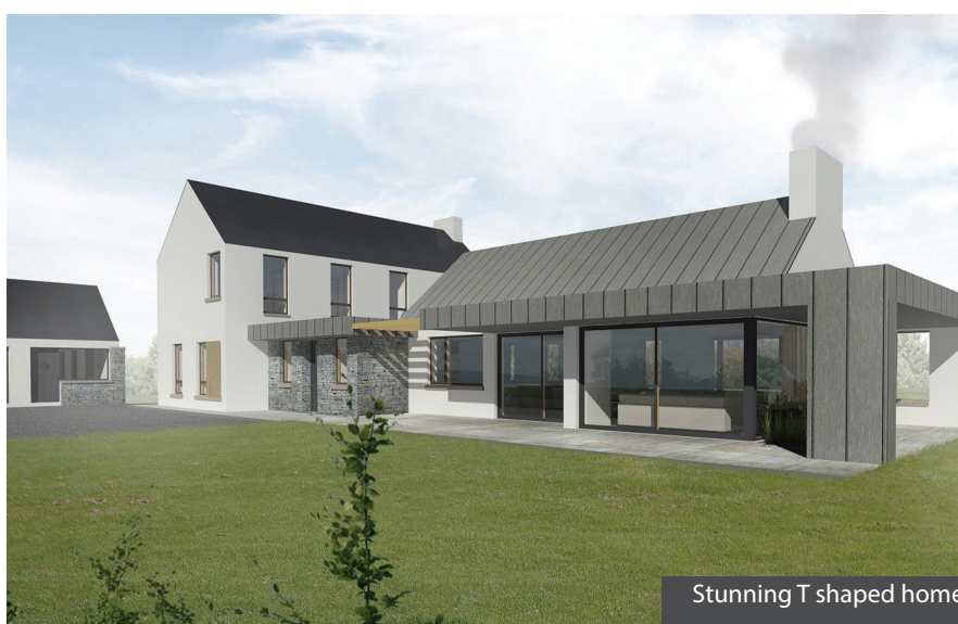
Stunning T shaped home