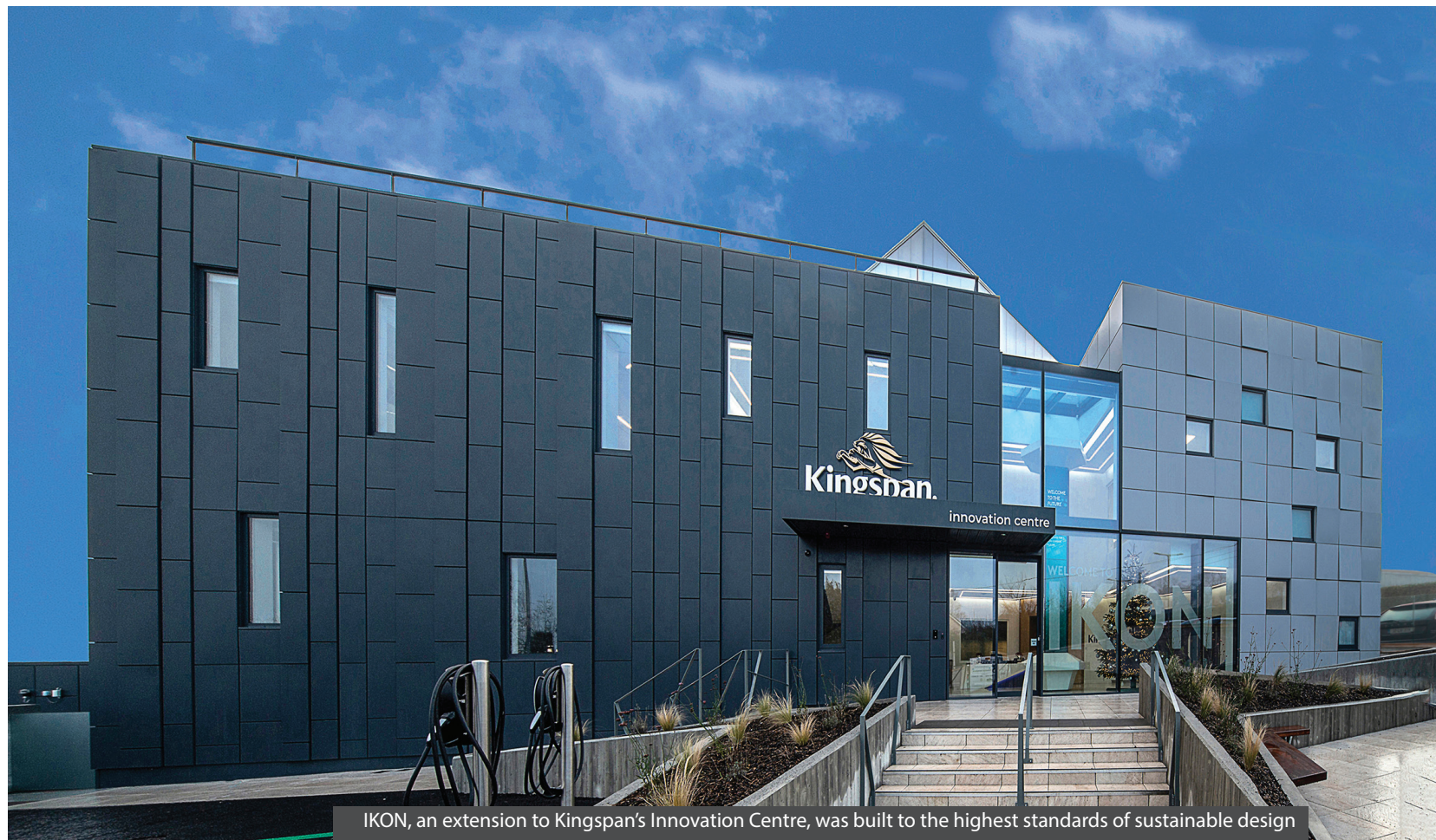
IKON, an extension to Kingspan's Innovation Centre, was built to the highest standards of sustainable design