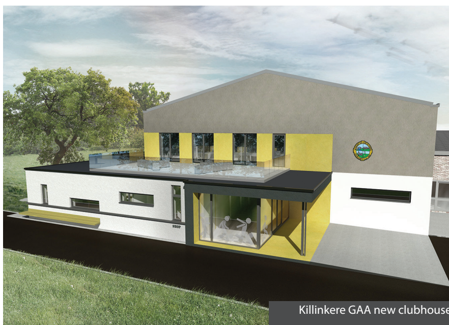
Killinkere GAA new clubhouse

"It's a compete design-team effort, which can vary considerably depending on the type of project, the budget and the scale of the project," the in-demand Kingscourt architect concludes. "You are forever trying to find viable solutions which maintain the integrity of design and are affordable without compromising on quality."