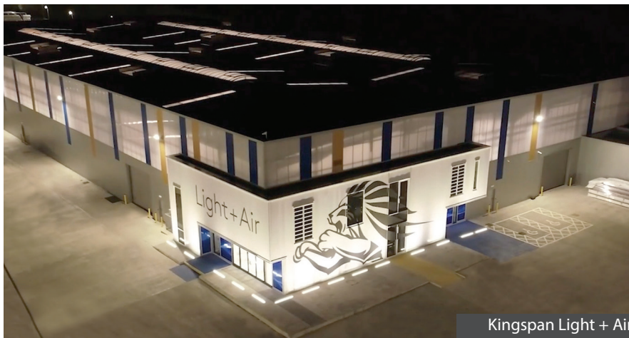
Kingspan Light + Air

planting to minimise the house's visibility when approaching the castle. The backdrop of mature trees and the low linear nature of the building and its stepped roof planes allow Cabra House to sit into the landscape and respond