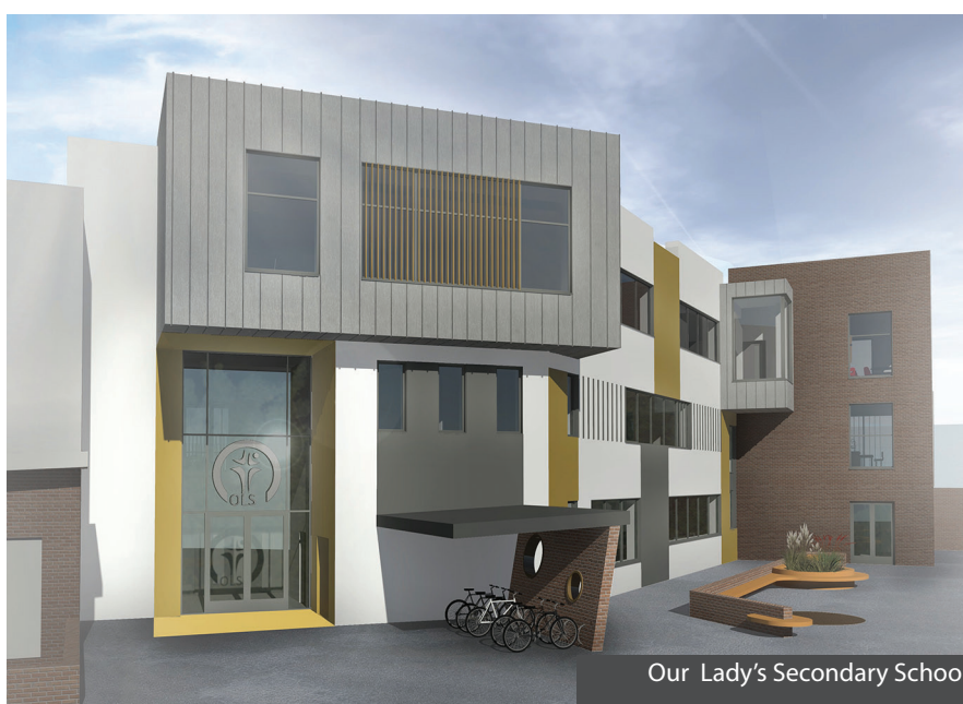
Our Lady's Secondary School